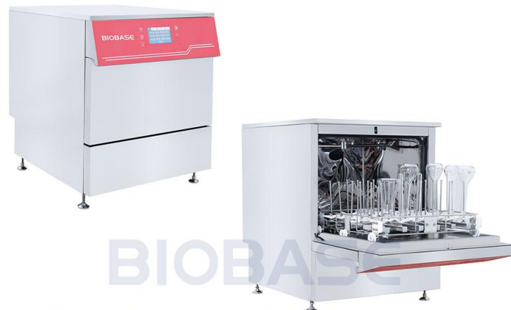
Table Top Full-automatic Glassware Washer